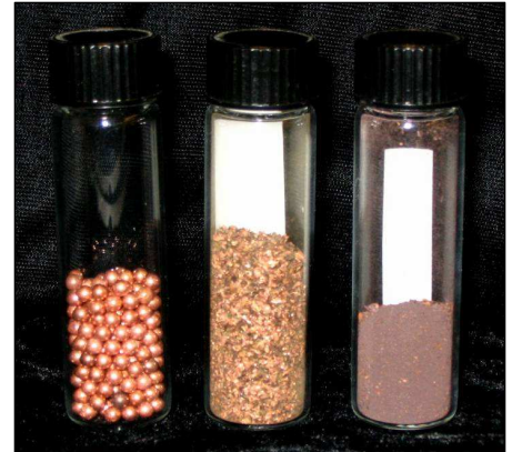
Copper produced as bright plating (left), bright flake (center) and dendrites (right) with Eltron's electrowinning technology.

The system can electrowin metals from leach directly fed into it or from a pre-concentrated leach solution. The reactor design cuts capital investment and can be scaled to match application requirements. Operator safety is improved, since the system is able to process halide-based feed streams without chlorine gas production, contain acid aerosols and minimize, contain and control H 2 . And, the system can run unattended, helping to reduce labor requirements.